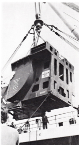
■ B&C vessels continue to get their share of heavy lifts. In the pictures above, left and right, Clan Macilwraith uses her own gear to discharge a 60-ton piece of machinery onto one of Pickfords low loaders. The massive item was destined for the British Steel Corporation's Anchor Project in Scunthorpe, and was manufactured by the Broderick Engineering Works Ltd.